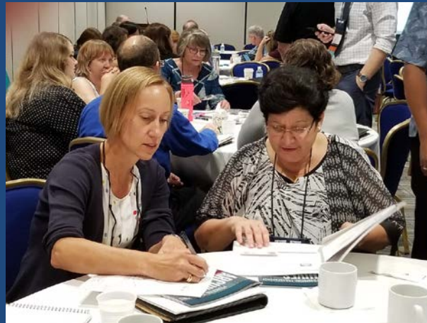
CoSA Member Webinar - August 23, 2018